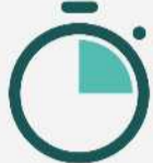
Time & Attendance